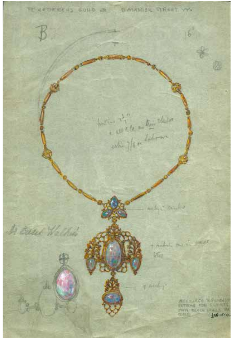
'Artificers' Guild Archive. The Goldsmiths' Company'